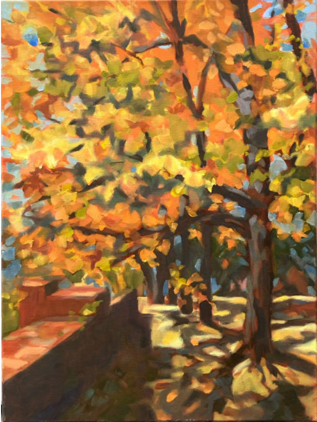
Autumn on Port Road

Joetta Deaton | 2024 | oil on canvas | 18" x 24"