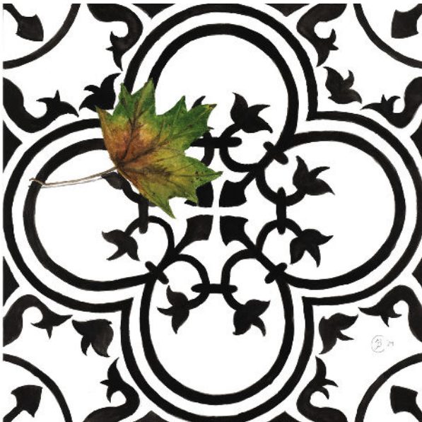
Autumn Leaf on Tile

These hosts open their homes to a weekly small group meeting. We currently have about 19 small groups. If you intend to continue serving as a host for 2025, please note in the appropriate box. If you're interested in offering your home, you can note your interest and we'll be in touch.