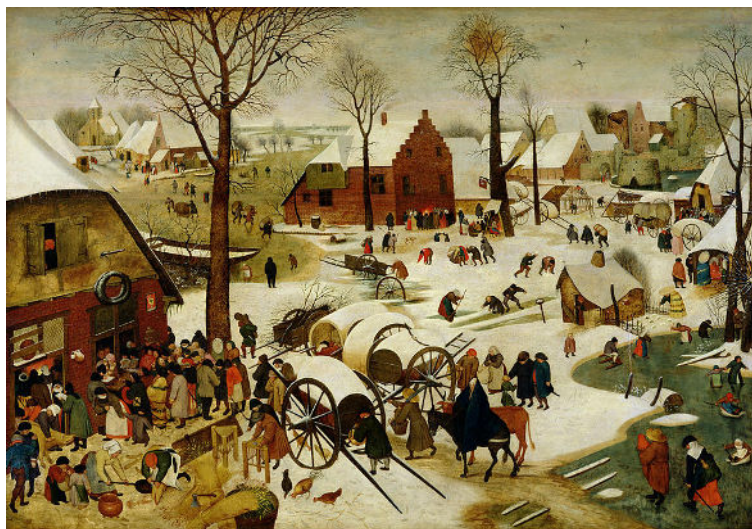
The Census at Bethlehem | Pieter Bruegel | 1566 | Flemish