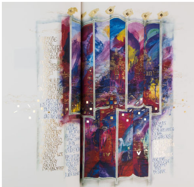
Psalms Frontispiece, The Saint John's Bible

The grace of our Lord Jesus Christ, and the love of God, and the fellowship of the Holy Spirit, be with us all evermore. Amen. 2 Corinthians 13:14