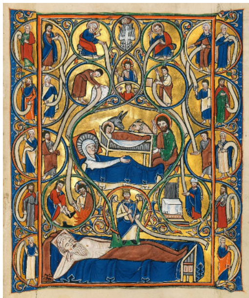
Tree of Jesse from an English Psalter in Latin c. 1190-1210