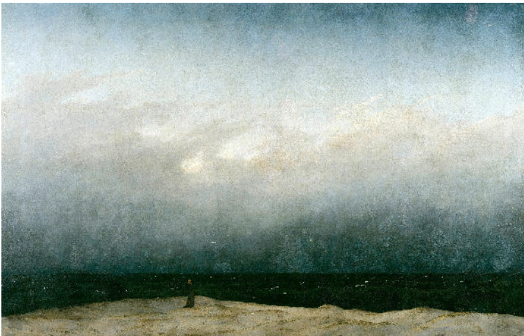
Monk by the Sea | David Caspar Friedrich | 1808–1810 | German