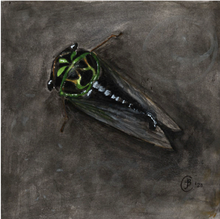
Cicada on Concrete

This group helps lead and facilitate women's ministry at Incarnation, from leading women's bible studies to hosting and leading a mom's group, women's retreats, and other ministries related to caring and disciplining the women at Incarnation. If you want to serve in this ministry, note your interest, and we'll be in touch.