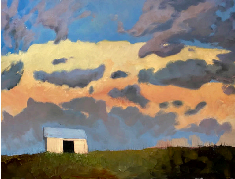
Landscape with Barn, Evening

Leslie Banta | 2023 | oil on canvas | 36" x 48"