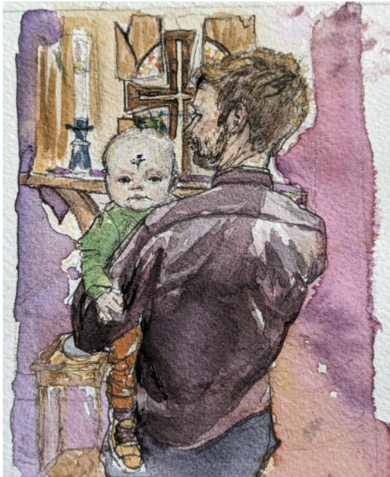
God's Not a Beast, He's a Hen

Regardless of our age, we are all growing and maturing in our faith and understanding of Scripture. Incarnation is committed to the continual spiritual growth of every person in our congregation.