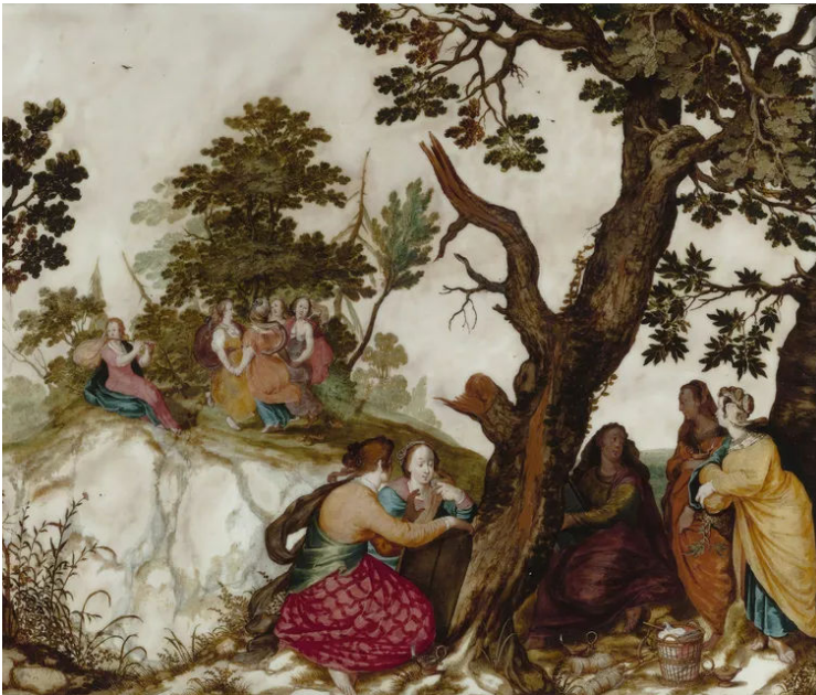
The Parable of the Wise and Foolish Virgins Peter Lisaert | Oil on marble | c.1620

Sat, 12.24 Jesus' Birth (Manger) Luke 2:1–7