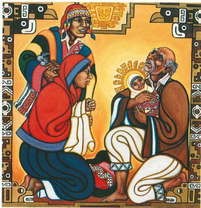
Simeon Blessing the Christ Child