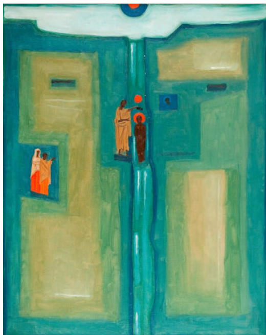
The Baptism of Jesus Christ in the Jordan