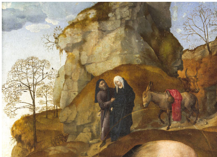
Mary and Joseph on the Way to Bethlehem Hugo van der Goes | 1475

The grace of our Lord Jesus Christ, and the love of God, and the fellowship of the Holy Spirit, be with us all evermore. Amen. 2 Corinthians 13:14