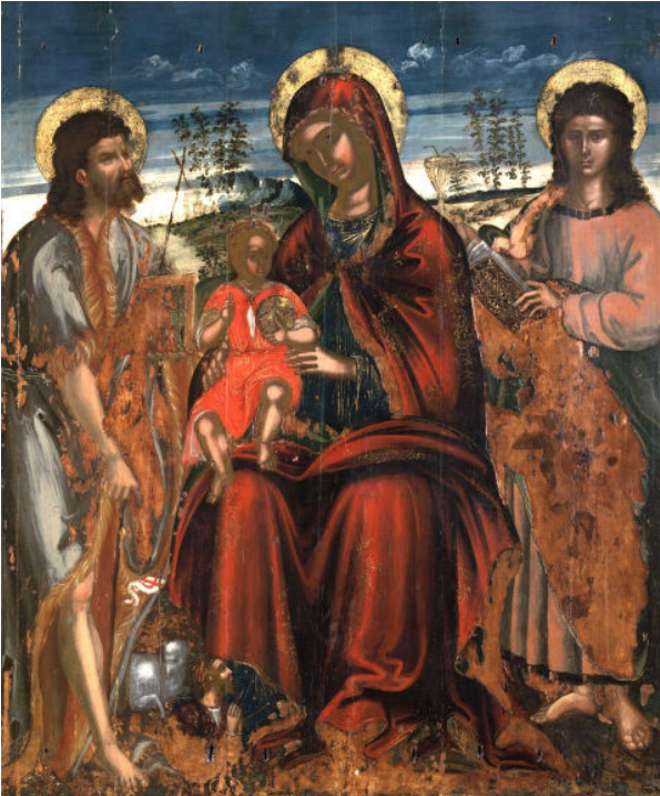
Virgin & Child with St. John the Baptist & St. John the Evangelist | Unknown | 16th c.

The grace of our Lord Jesus Christ, and the love of God, and the fellowship of the Holy Spirit, be with us all evermore. Amen.