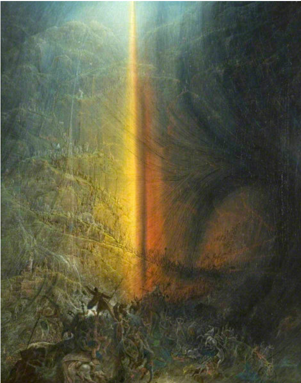
The Destruction of Pharaoh's Host